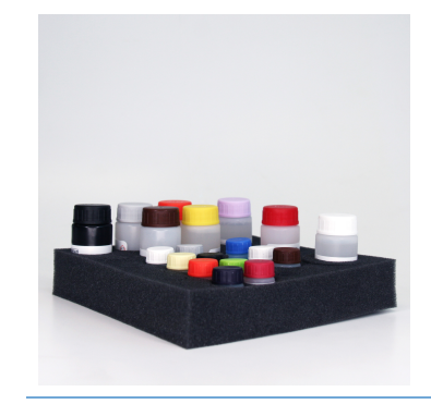
Tryptophan ELISA kit