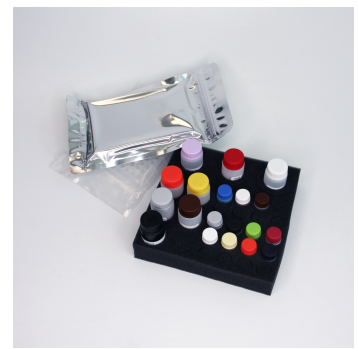
Tryptophan ELISA kit